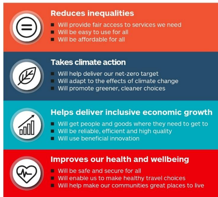
Figure 1 Transport Scotland's vision

We will have a sustainable, inclusive, safe and accessible transport system, helping deliver a healthier, fairer and more prosperous Scotland for communities, businesses and visitors.