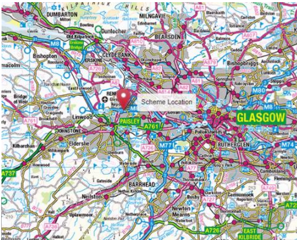
Figure 3: Proposed Scheme Location.