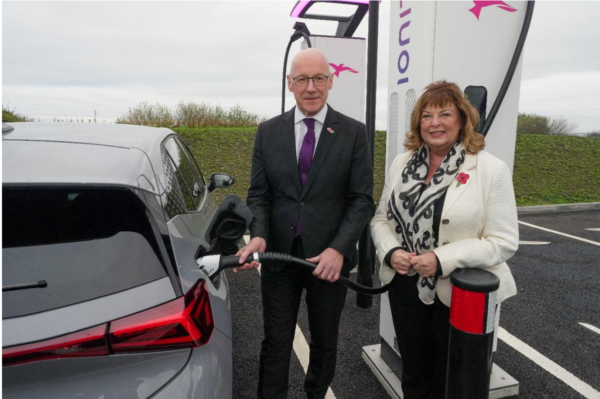
Image 1: First Minister and the Cabinet Secretary for Transport use an IONITY Rapid EV charging Hub in Ayr during their attendance at the Travelling Cabinet in November 2024.