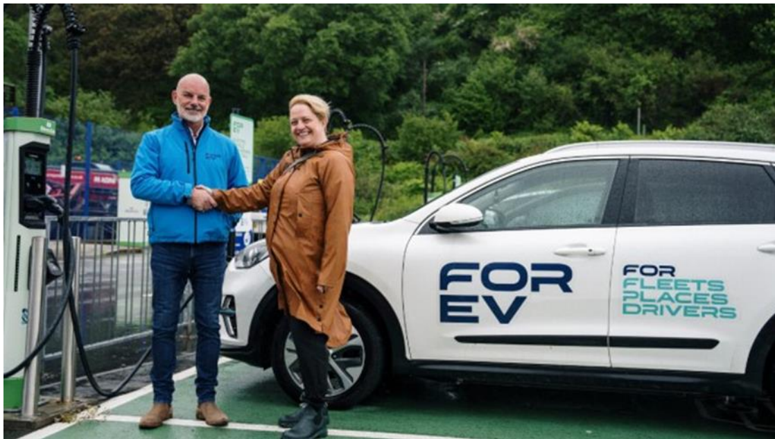
Image 2:

In June 2024, FOR EV and South of Scotland Enterprise unveiled a new rapid charging hub at Loch Ryan ferry port in Cairnryan near Stranraer to support the UK's busiest domestic short sea route; Cairnryan-Belfast. This facility services both Stena Line's customers as well as the local community and provides additional charging infrastructure for use by Police Scotland.