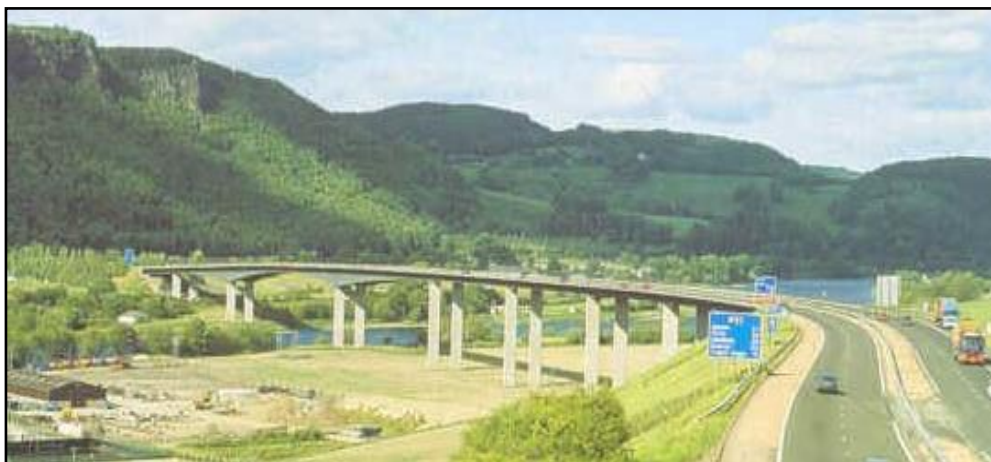
Figure 4.15.2.A – M90 10-11 55 Friarton Bridge

Constructed in 1978 this structure shown in Figure 4.15.2.A and whose location is denoted within Figure 4.15.2.B comprises 9 spans with an overall length of 831m with including a main river span of 174 metres and carries the M90 over the River Tay. The superstructure comprises a steel box and composite concrete deck upon reinforced concrete columns with concrete end abutments. The deck supports two 7.3 metre carriageways along with a median and two access verges.