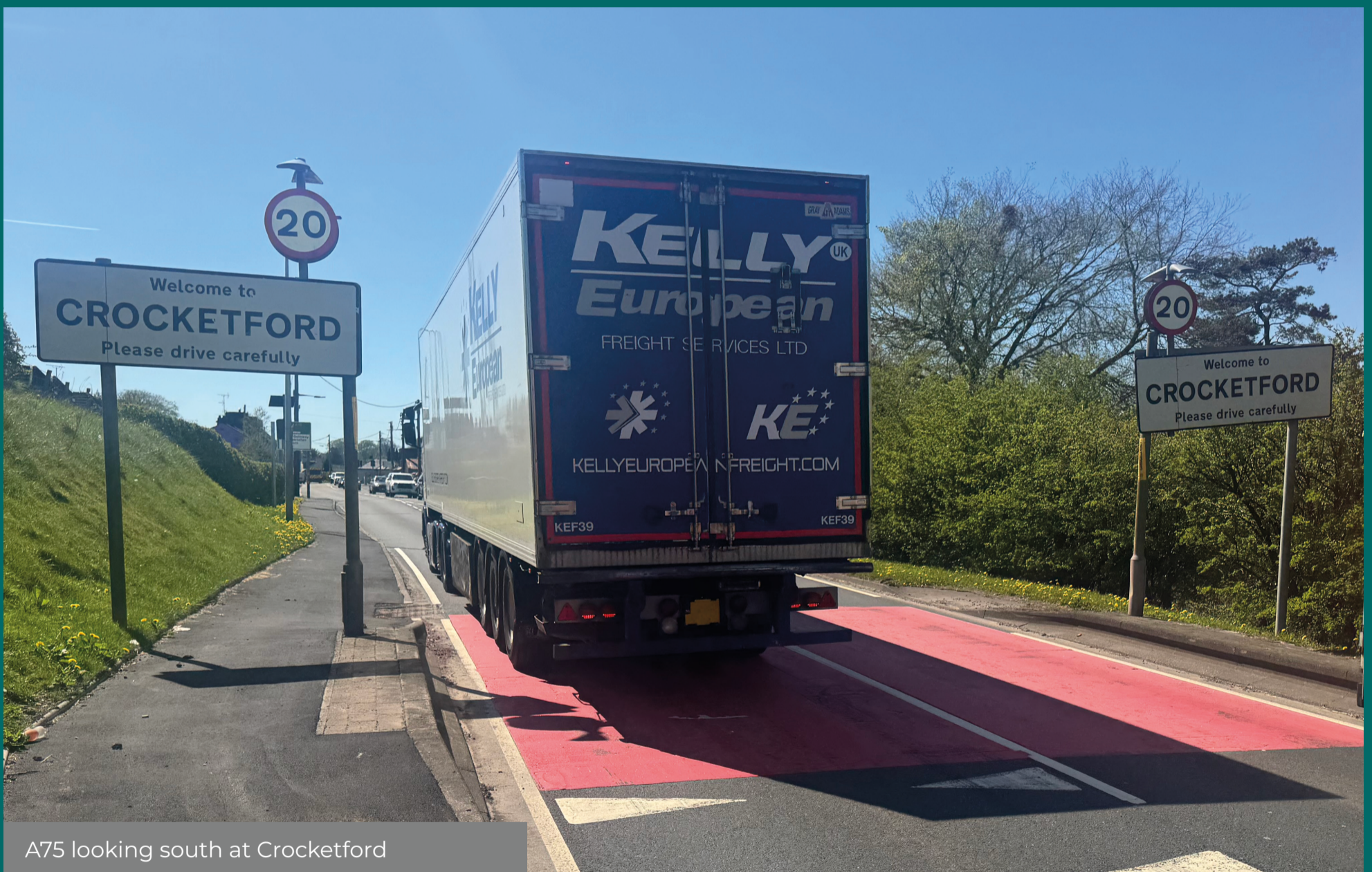
A75 looking south at Crocketford

Please take the time to review the information on display, speak to a member of our team and provide your feedback by completing a feedback form or sending it to us after today's event.