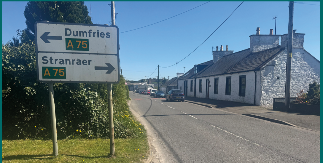
Traffic Sign in Crocketford indicating directions for Dumfries and Stranraer

For privacy information see the scheme's privacy notice on the Transport Scotland website.